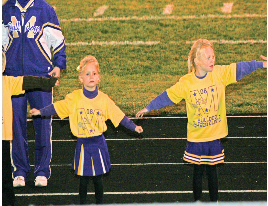
McLouth students participate in the MHS cheerleader clinic and perform at half-time on October 17th.